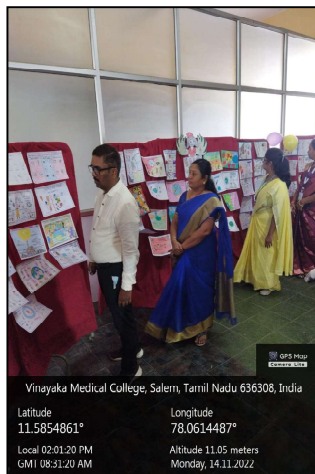
Vinayaka Medical College, Salem, Tamil Nadu 636308, India Latitude 11.5854861° Longitude 78.0614487° Local 02:01:20 PM Altitude 11.05 meters GMT 08:31:20 AM Monday, 14.11.2022