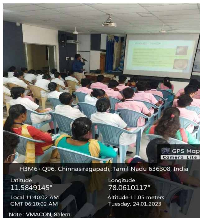
H3M6+Q96, Chinnasiragapadi, Tamil Nadu 636308, India