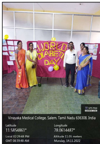
Vinayaka Medical College, Salem, Tamil Nadu 636308, India Latitude 11.5854861° Longitude 78.0614487° Local 02:29:48 PM Altitude 11.05 meters GMT 08:59:48 AM Monday, 14.11.2022